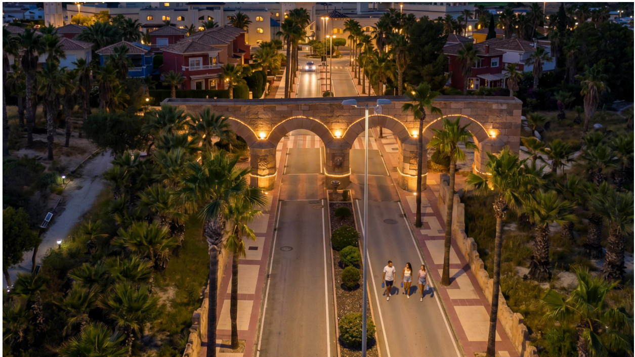
Evenings at Altaona, where a walk home is simply a walk home

Buyers who have lived elsewhere recognise it at once. The relief of not checking the door twice, of letting the children cycle to a friend's home, of walking back from dinner without a second thought.