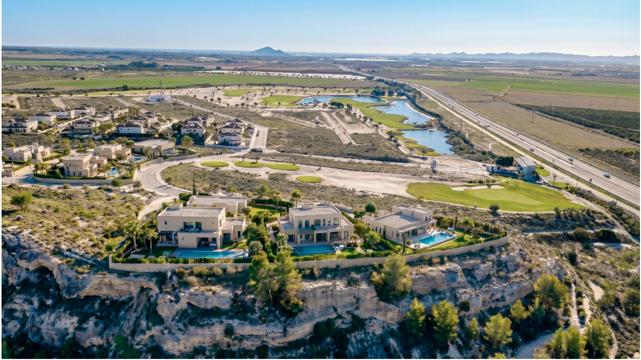
Altaona Sport & Wellness Resort, gated and secure, within Carrascoy and El Valle Natural Park

Altaona is a master-planned, gated community with an established base of international residents who live here year-round. This is a genuine neighbourhood, with an 18-hole golf course, tennis and padel, and a full calendar of social events.