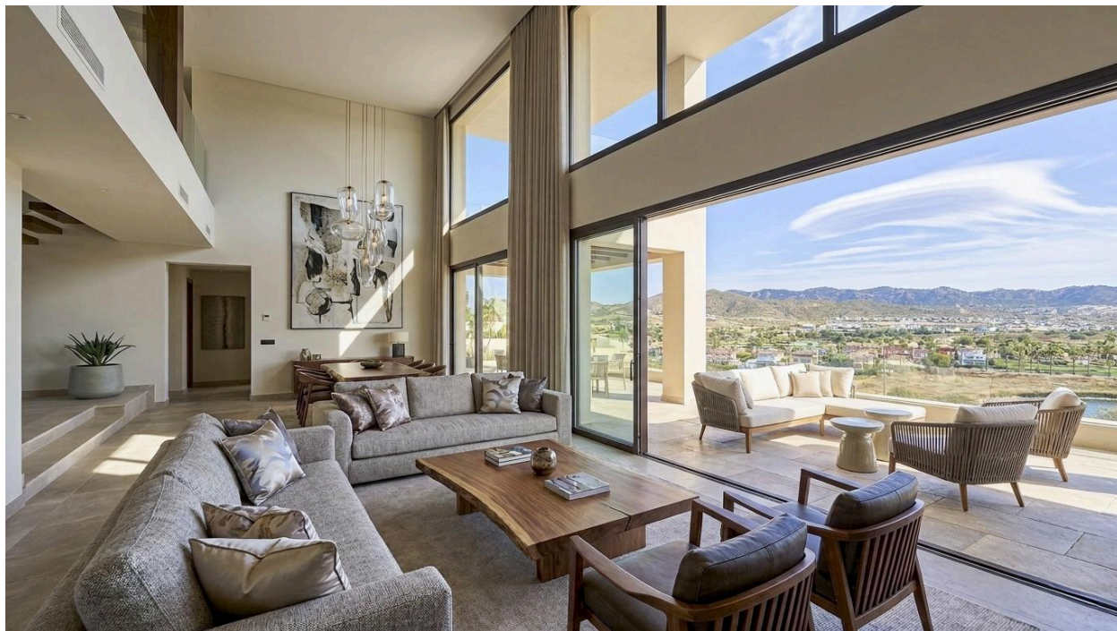
A private villa at dusk, enclosed, calm and entirely your own.

A safe home does more than shelter you. It restores you. Altaona will soon add the WOW Longevity Hotel and Clinic, Europe's first Blue Zone-inspired longevity hotel, created with Swiss health partners.