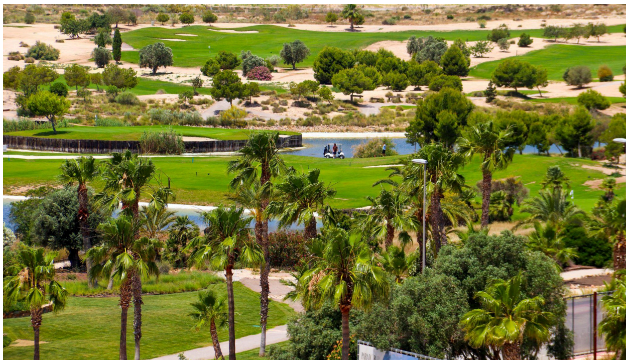
The resort's 18-hole course, framed by the Carrasco landscape

Altaona is home to an established international community that lives here throughout the year. Shops open, programmes run and neighbours meet long after the holiday season ends. That continuity is what separates a real place from a seasonal resort.