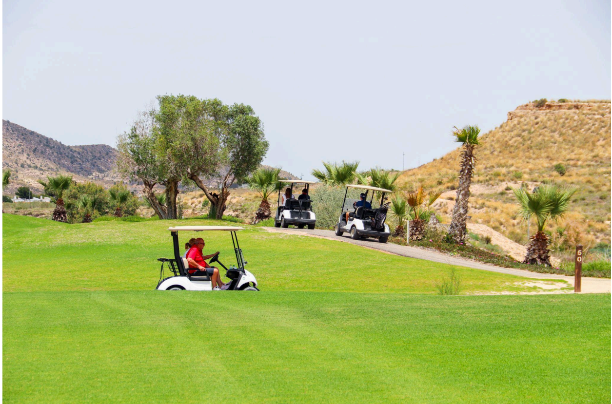
Everyday life along the resort's landscaped walkways

Life at Altaona runs on a daily rhythm, not a holiday calendar. Mornings begin with a walk or a round of golf, and neighbours know each other by name. This is a settled community where wellbeing shapes the ordinary day.