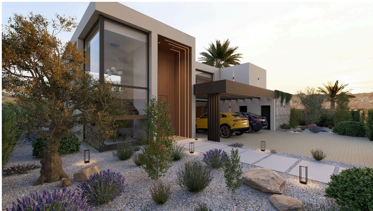
A completed Taolis villa, where build quality shows in every line

Every Taolis home is built using the SISMO system, which delivers superior insulation and an Energy A+ rating as standard. Interiors carry 100% Italian finishes, underfloor heating and aérothermal climate control. The result is a house that stays comfortable and efficient through every season.