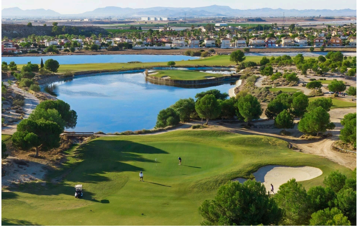
Altaona Sport & Wellness Resort: a master-planned community set against Carrascoy and El Valle Natural Park

Retirement abroad fails when the neighbourhood empties in October. Altaona is a permanent, international community where residents live year-round, not a seasonal holiday park.