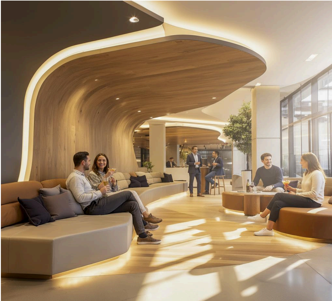
The WOW Longevity Hotel & Clinic: Europe's first Blue Zone-inspired longevity destination

The most valuable retirement asset is not property. It is healthspan. The WOW Longevity Hotel & Clinic brings Europe's first Blue Zone-inspired longevity concept to Altaona, developed with Swiss health partners.