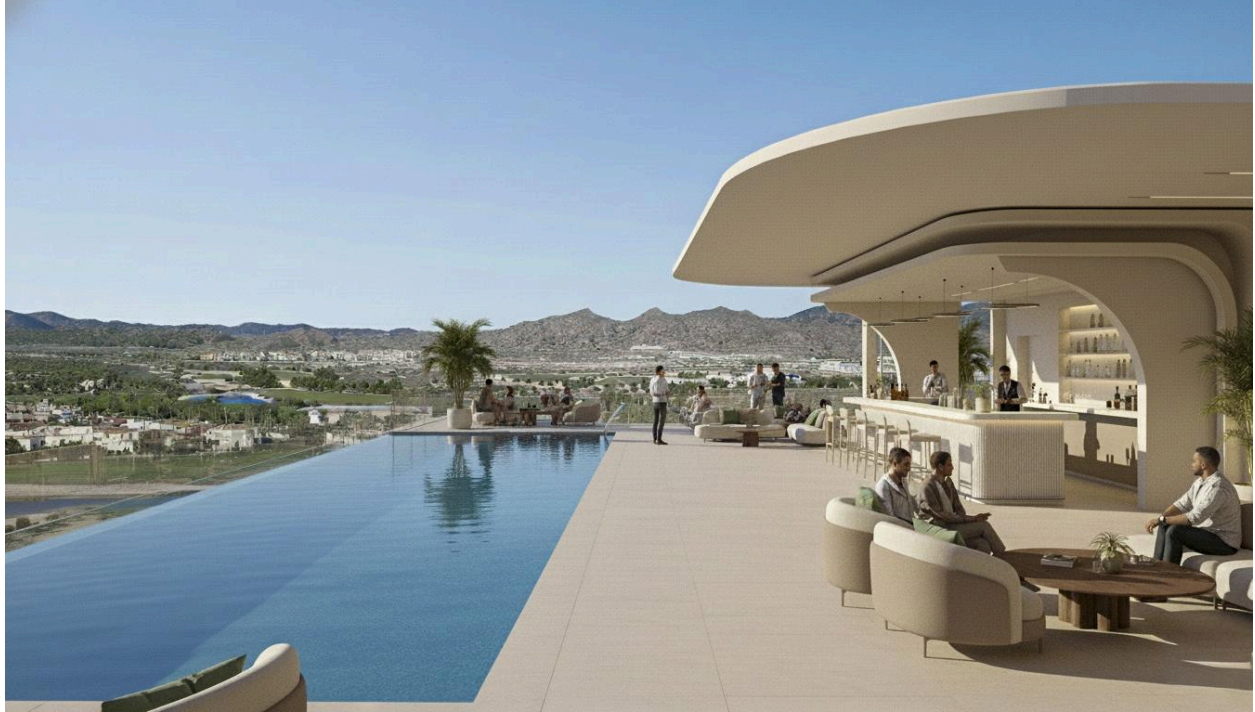
WOW Longevity Hotel & Clinic – Europe's first Blue Zone-inspired longevity residence.

The WOW Longevity Hotel & Clinic is the first of its kind in Europe, Blue Zone-inspired, anchored by Swiss health partners, and built around personalised programmes for the decades ahead. Construction runs 2027–2028, with operations from 2029.