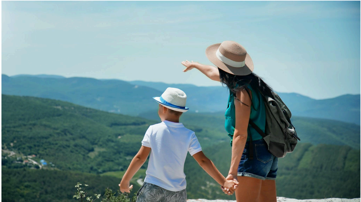
Active mornings in Carrascoy and El Valle Natural Park — daily movement built into where you live.

Health in your sixties is rarely built in a gym. It is built in the small daily choices a place makes easy: a morning walk, an outdoor lunch, a cycle through the park before the day starts.